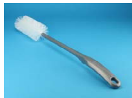
AR71030 (71030/71036) Filter Brush