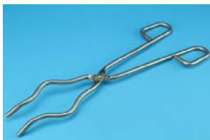
AR929 (90145) Crucible Tongs