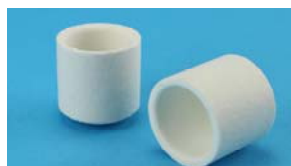
Ceramic Crucibles AR3818F (90149) Foil Wrapped AR3818 (90148) Bagged