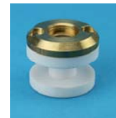
Heat Shield AR14072 (14072)