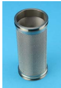
Dust Filter AR311 (11105)