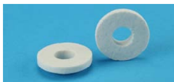
Ceramic Crucibles Covers 10mm Hole AR9880 (88600-0014)