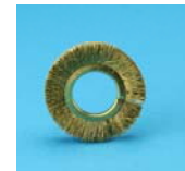
Auto Cleaner Combustion Tube Brush AR14045 (14045)